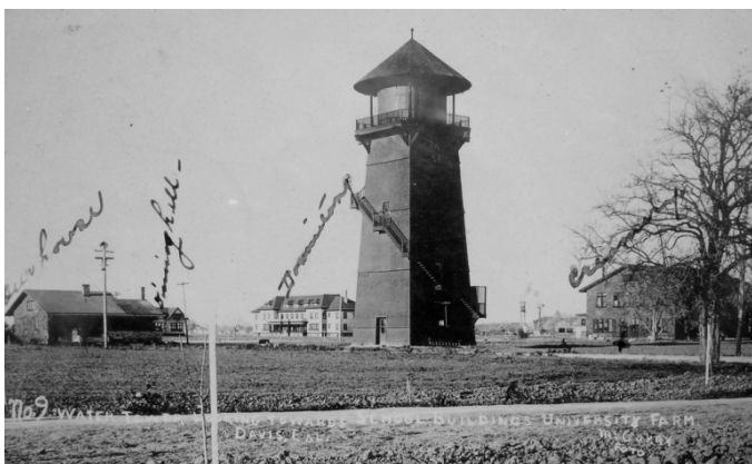
The new University Farm around 1910 already has a impressive cluster of large and tall structures that is effectively captured on this McCurry Photography Company (of Sacramento) card