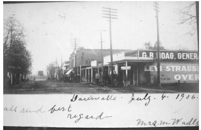
Downtown Davis looks unimpressive in scale on July 4th, 1906, just before the University Farm stimulated an investment boom. The photo and card were among the hundreds of skillfully done urban scenes produced at Shinkle's Photography Studio in Woodland

The Museum's exhibit includes a short history of postcards and of deltiology. In 1861, the first post cards mailed in the U.S.A. had a decorative border and a stamp box on a single side. Shortly after, Congress authorized "official" Post Office postcards that could be mailed for one cent while requiring a two-cent stamp on all privately printed cards. Elaborately decorated cards were sold as souvenirs at the 1893 Columbian Exposition, setting off the "golden age of postcards" between then and 1940. By 1907 regulations allowed the address and the message to share the stamped side while an image (increasingly a photograph) occupied the other full side. A national craze for sending postcards was aided greatly by the Eastman-Kodak "3A Folding Pocket Camera." That ingenious innovation of 1904 was sold with Kodak's "Real Photo" paper that had the address/message side pre-printed. Amateurs as well as professionals now could easily make photo postcards. "Linen cards" were in vogue during the 1930s, printed in color on textured paper. Color "photo-chrome cards" after World War II looked very much like the vividly colored postcards you still see in souvenir outlets.