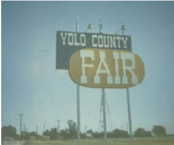
Welcome to the Yolo County Fair - Sign located at the Main Entrance 1950s

The first Yolo County Fair was held in the late summer of 1893 with horse racing being the main event. The Fair continued for several years until pari-mutuel horse racing was outlawed.